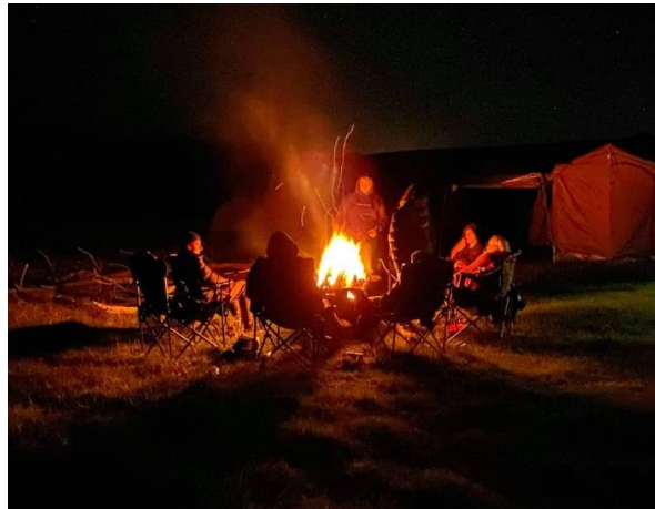
Nothing beats sitting around and enjoying a fire whilst on scout camp

If you would like to share your stories of your time in the scouting movement, drop me a line at rochelle@meridianmaps.com.au .